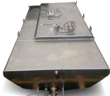
Catamaran fuel tank