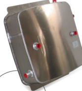
Aluminium oily water tank