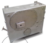
Stainless steel oily water tank