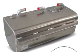
Grey water tank