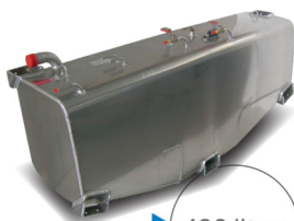
Aluminium fuel tank